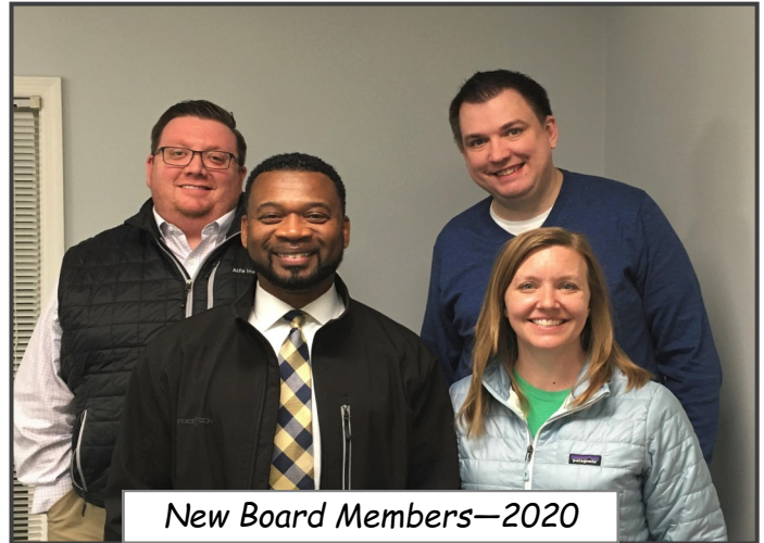
New Board Members—2020